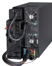
9PX 11kVA with Maintenance ByPass