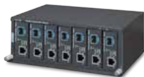
Media Chassis Installation