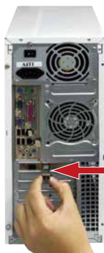
MTB 10GBASE-SR/LR mini-GBIC Module 300m~60km

The 10GBASE-LR/SR mini-GBIC module can be installed into PLANET products with 10G SFP+ interface like ENW-9801 NIC card. The 10G SFP+ slots of the ENW-9801 are hot-pluggable and hot-swappable. With the ENW-9801 installed in the PC, you can plug and pull out the 10GBASE-LR/SR mini-GBIC module in and from the 10G SFP+ slot of the ENW-9801, respectively, without having to power off the PC.