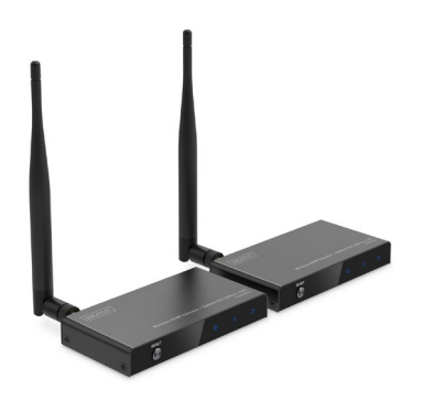
Manual DS-55346 - DS-55347