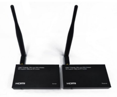
Step 1: Install the antennas for the transmitter and receiver.

The set (DS-55346) already has the transmitter & receiver paired at the factory. If you want to pair the transmitter & receiver again or add additional receivers (DS-55347), please follow the steps below: