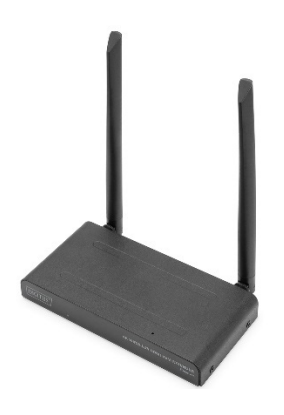
Quick Installation Guide DS-55329