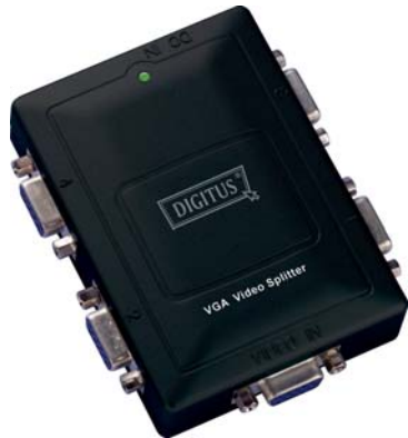
(DS-42120) 1 In 4 Out