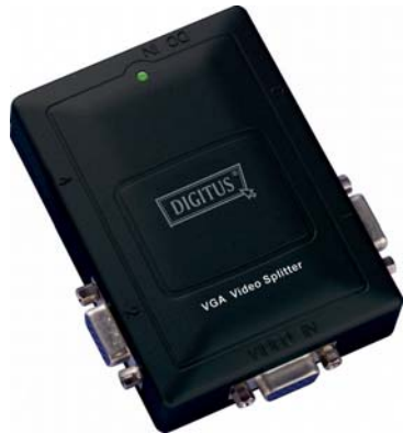
(DS-41120) 1 In 2 Out