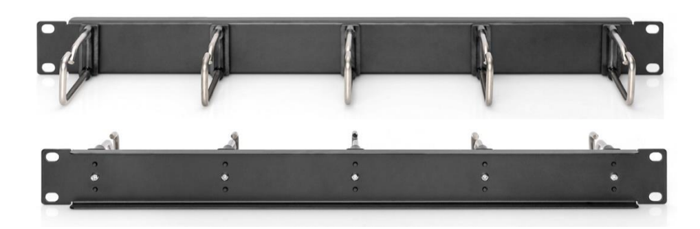
DN-97668 & DN-97669