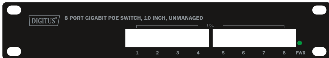
Figure 1. Front Panel view