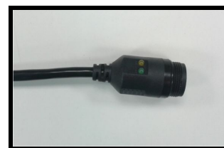
IP66 RJ-45 Cable

DN-16086 uses an IP66 RJ-45 cable (as shown below) for connection. For full instructions, refer to sub-section Outdoor Camera of section Connect Ethernet Cable in the User's Manual in the supplied CD.