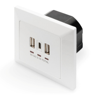
Quick Installation Guide DA-70618 Rev. 2