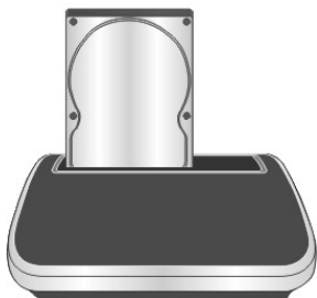
Install 2.5" HDD