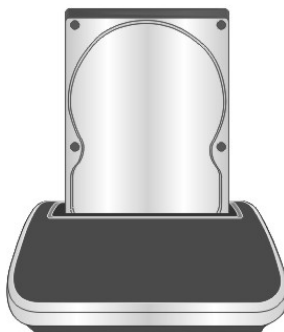
Install 3.5" HDD