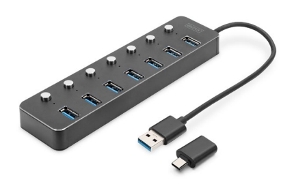
Quick Installation Guide DA-70248