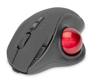
Quick Installation Guide DA-20156