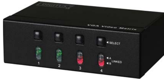
2 in 4 Out (DS-48110)