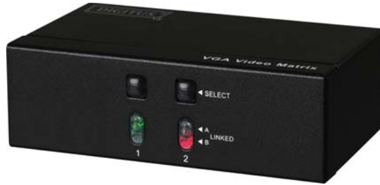
2 in 2 Out (DS-47110)