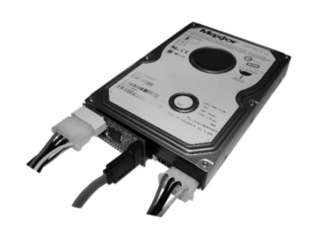
Note1: IDE device must be set on Master Mode.

Note2: Please make sure that your PC is shut down during your hardware installation. This PATA to SATA 150 Converter with your IDE device is not hot swap device and please shut down your computer before your want to connect this device.