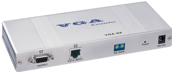
DC-53602 / DC-53702