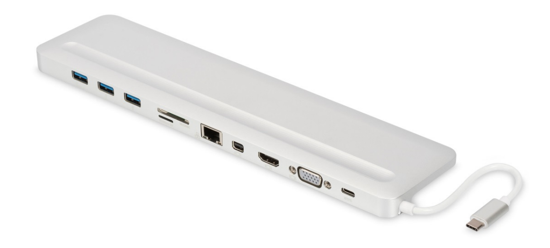
Manual DA-70860 (silver) • DA-70862 (grey)

The fully functional and precise fitting notebook docking station from DIGITUS offers everything you need to create a fully equipped workstation. It offers three video interfaces (HDMI, MiniDP, VGA), where two monitors can be operated at the same time. Thus, the best possible supported resolution is achieved: Brilliant UHD (4K2K/30Hz). In addition, there are three USB 3.0 ports, where one port (5V/1.5A) also provides a charging function for mobile devices. The USB interfaces are supplemented by a USB-C with power delivery (PD) functionality. Two card readers are also built in (MicroSD, SDHC, SDXC/MMC). Your notebook can also be connected to the network via cable over the Gigabit Ethernet port. We top everything off with a stereo audio port. Expand your 12" notebook by 11 additional ports via a single USB-C port - with the Digitus multi-functional 12" notebook docking station.